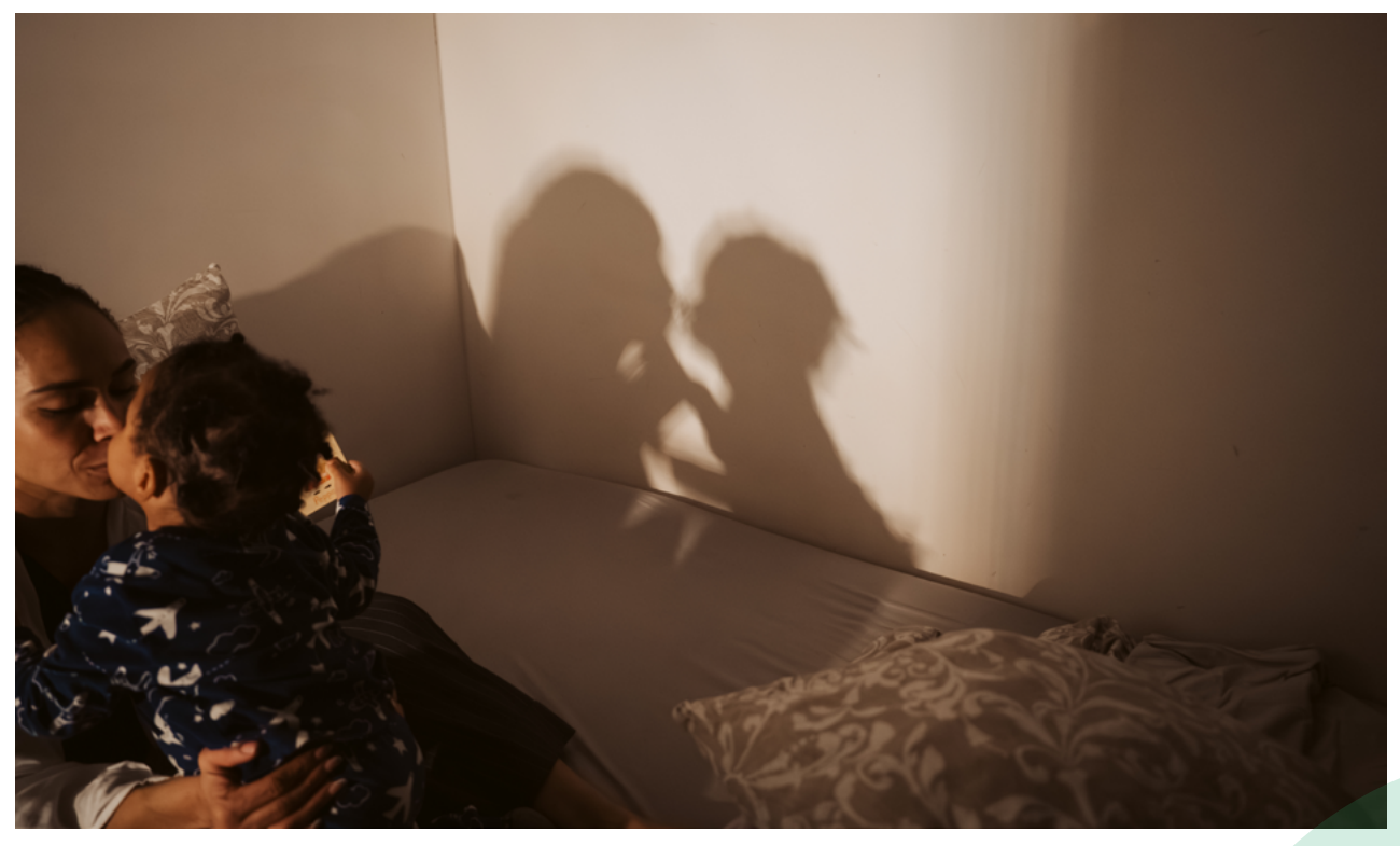
{\ensuremath{\,{}^{\nearrow}}} Find this article online at earlychildhoodmatters.online/2025-25