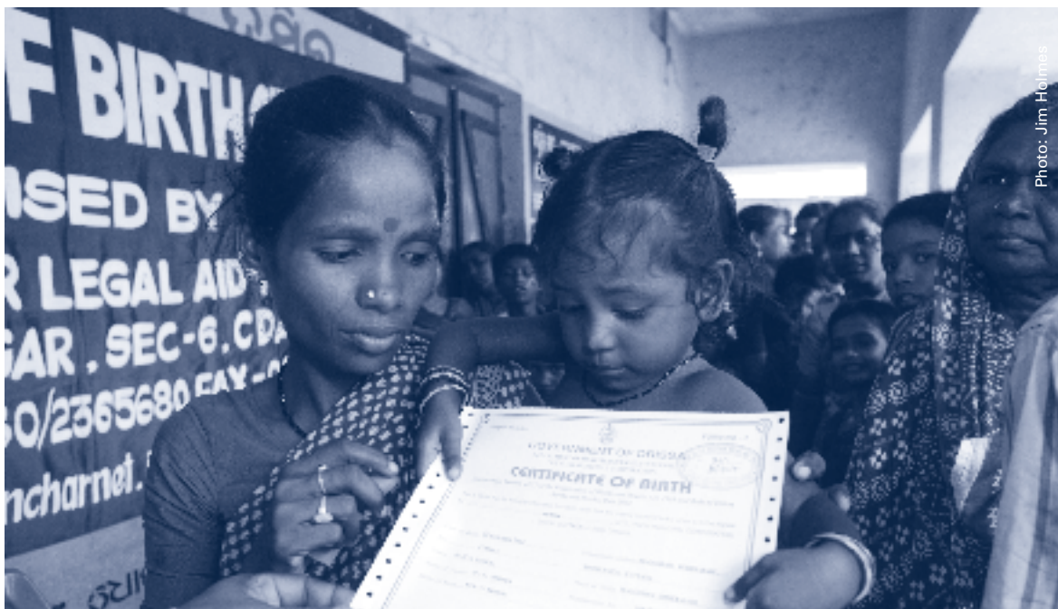
The Foundation's interventions also address issues such as birth registration, a fundamental right under Article 7 of the Convention on the Rights of the Child

into these local demands and actions. Possible interventions here include publications to disseminate successful strategies, and partnering with local advocacy organisations.