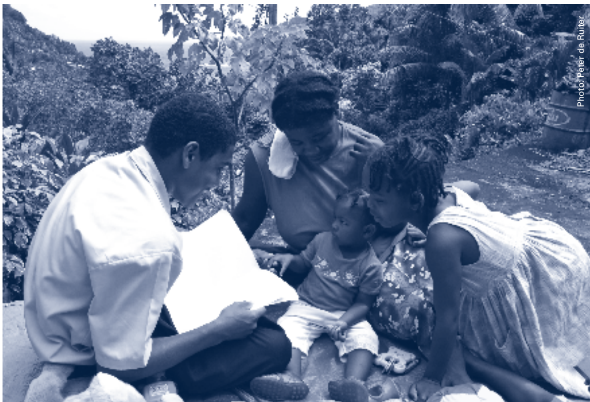
According to the Roving Care Program, parents and other caregivers within the home environment are the children's first teachers and therefore are critical in nurturing a child's cognitive and social skills